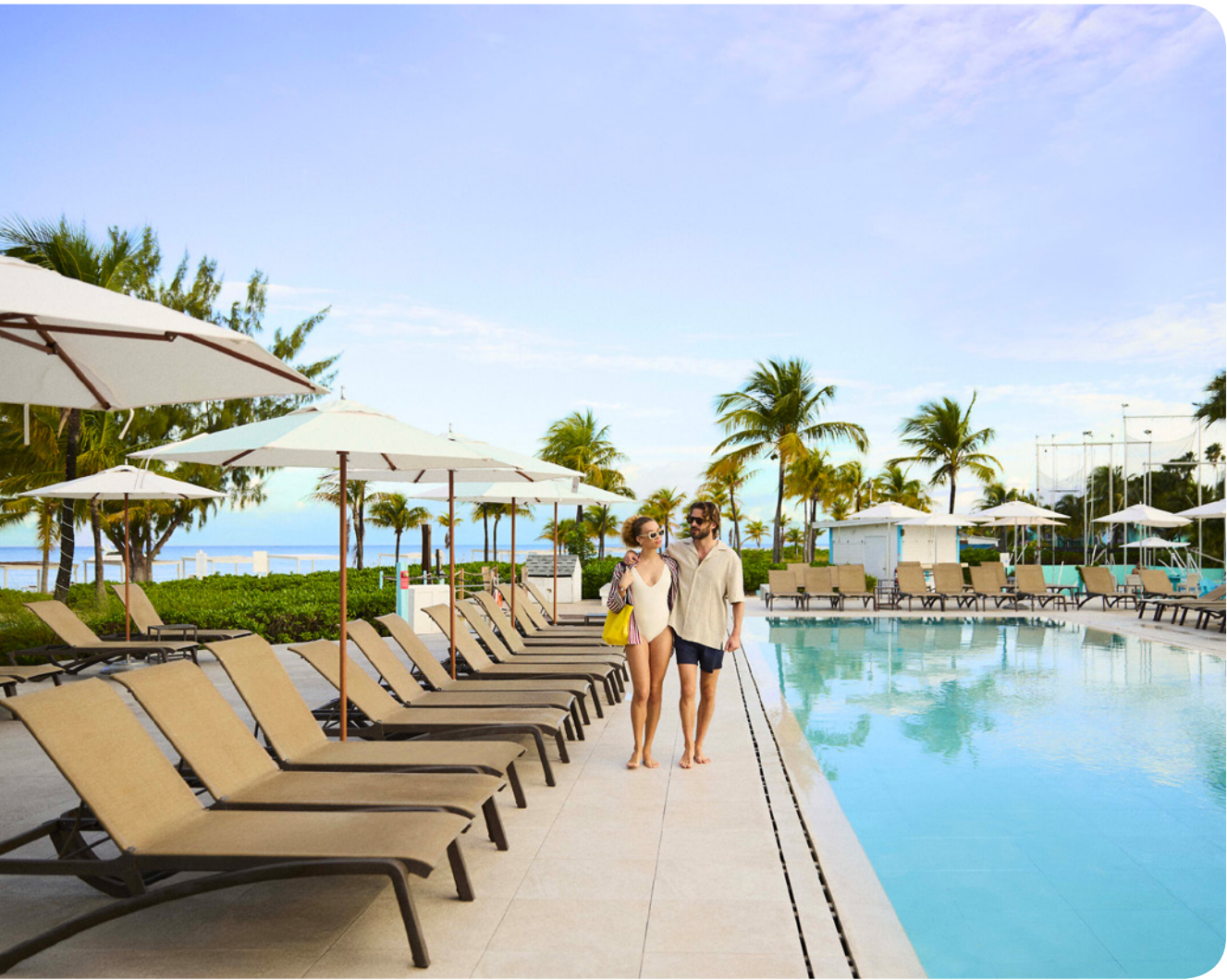
Main swimming pool Outdoor Pool